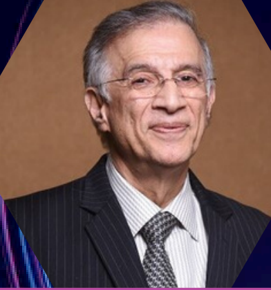
Dr. Niranjan Hiranandani President and Trustee